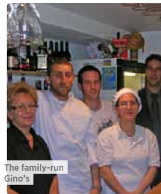
The family-run Gino's

Next month: 5 of the best restaurants with tasting menus If you have a favourite Sussex restaurant with a tasting menu, we'd love to know about it. Send us an email to sussexeditor@grubmagazine.co.uk with '5 of the best' in the subject box.