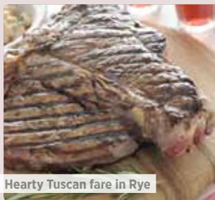
Hearty Tuscan fare in Rye

71 Seaside Road, Eastbourne, East Sussex BN21 3PL 01323 732832 momambo.com