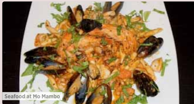
Seafood at Mo Mambo

Tuscan Kitchen, 8 Lion Street, Rye, East Sussex TN31 7LB 01797 223269 tuscankitchenrye.co.uk