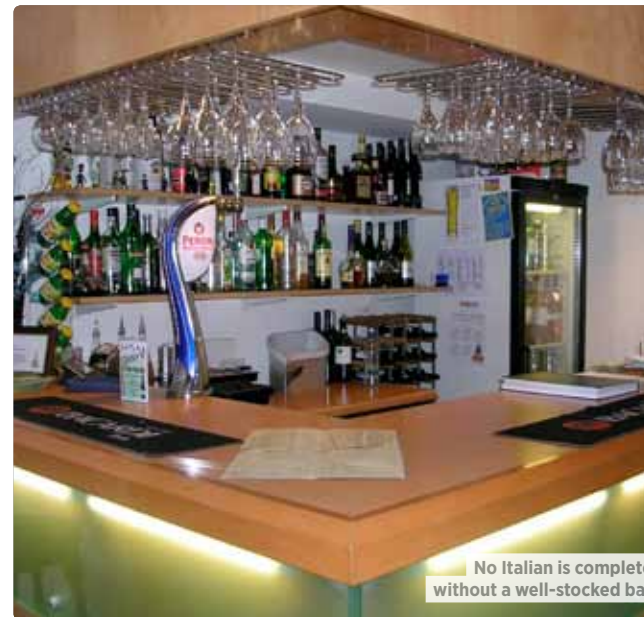
No Italian is complete without a well-stocked bar