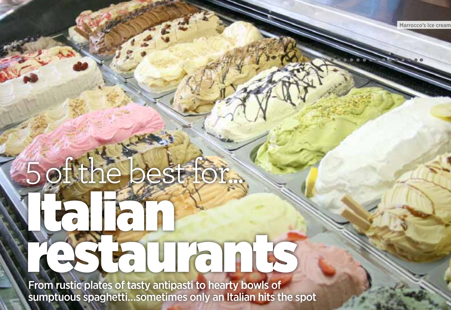
Marrocco's Ice cream