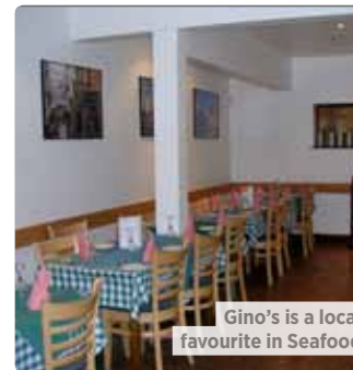
Gino's is a local favourite in Seaford

4 Claremont Road, Seaford, East Sussex BN25 2AY, 01323 890711 ginosseaford.co.uk